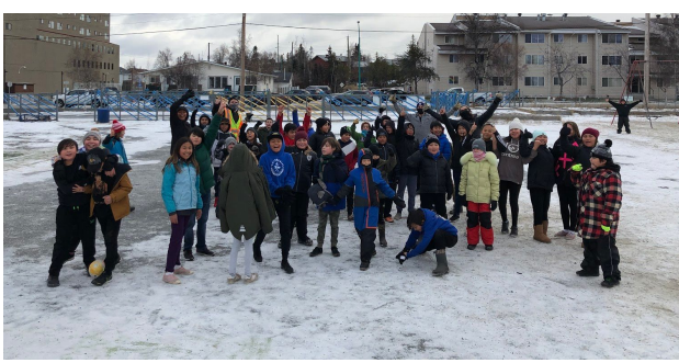
Mrs. CP's class was outside most of the day building, constructing and gathering items for various small structures!